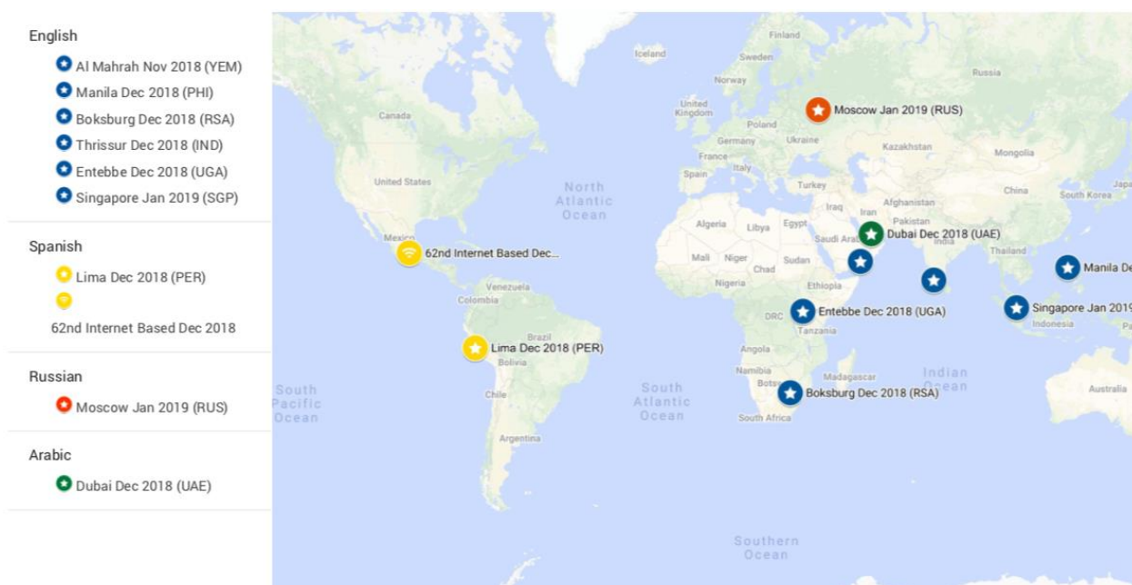
Map 1 – Seminars reported for 1st PB 2019