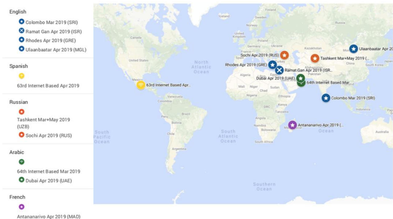
Map 1 – Seminars reported for 2nd PB 2019

*One Seminar was canceled Ramat Gan, ISRAEL, 22-24 April 2019