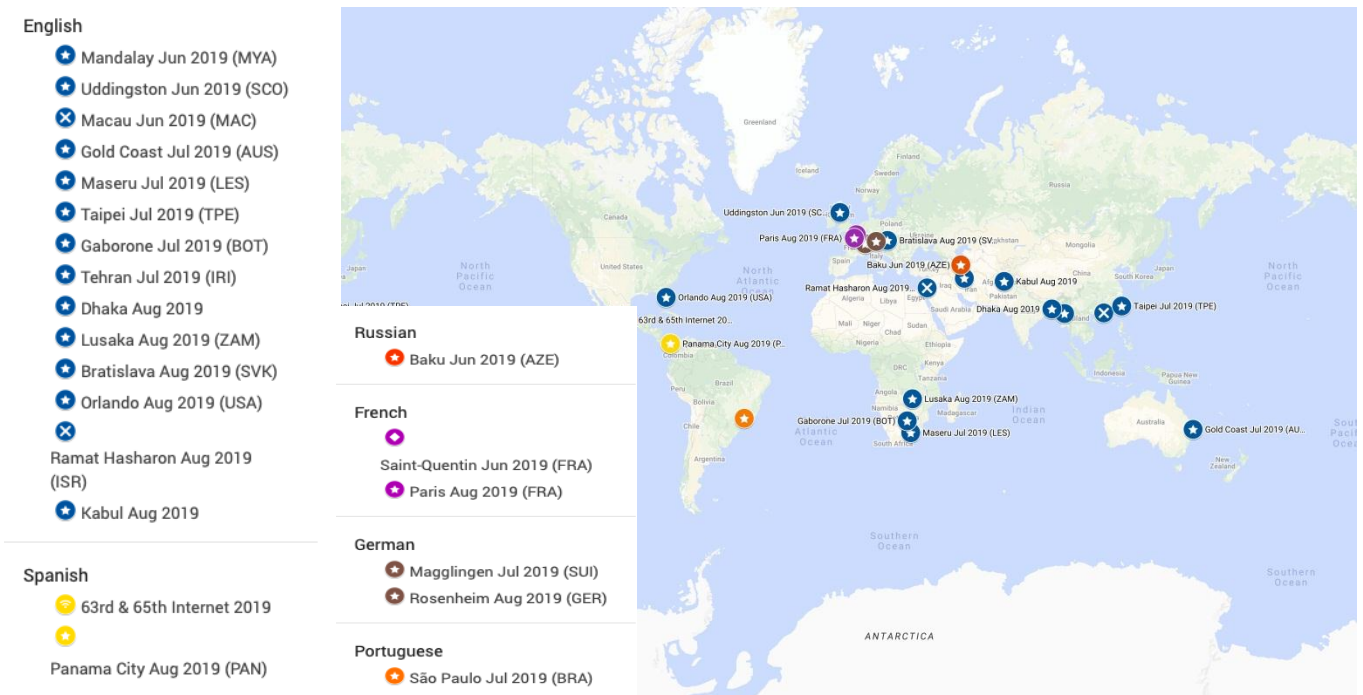
Map 1 – Seminars reported for 3rd PB 2019

* From the previous period: - 63 rd Internet Based Seminar, 23-30 April 2019 4 participants from 4 Federations