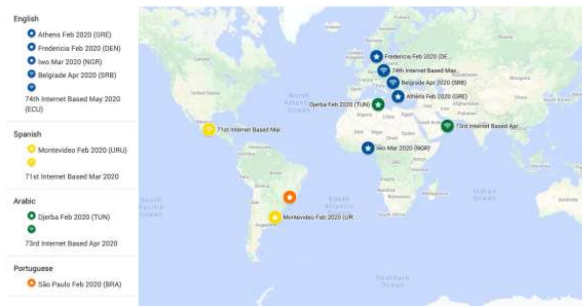
Map 1 – Seminars reported for 2nd FIDE Council 2020

- Lome, TOGO, 26-30 January 2020 (38 participants from 3 Federations)