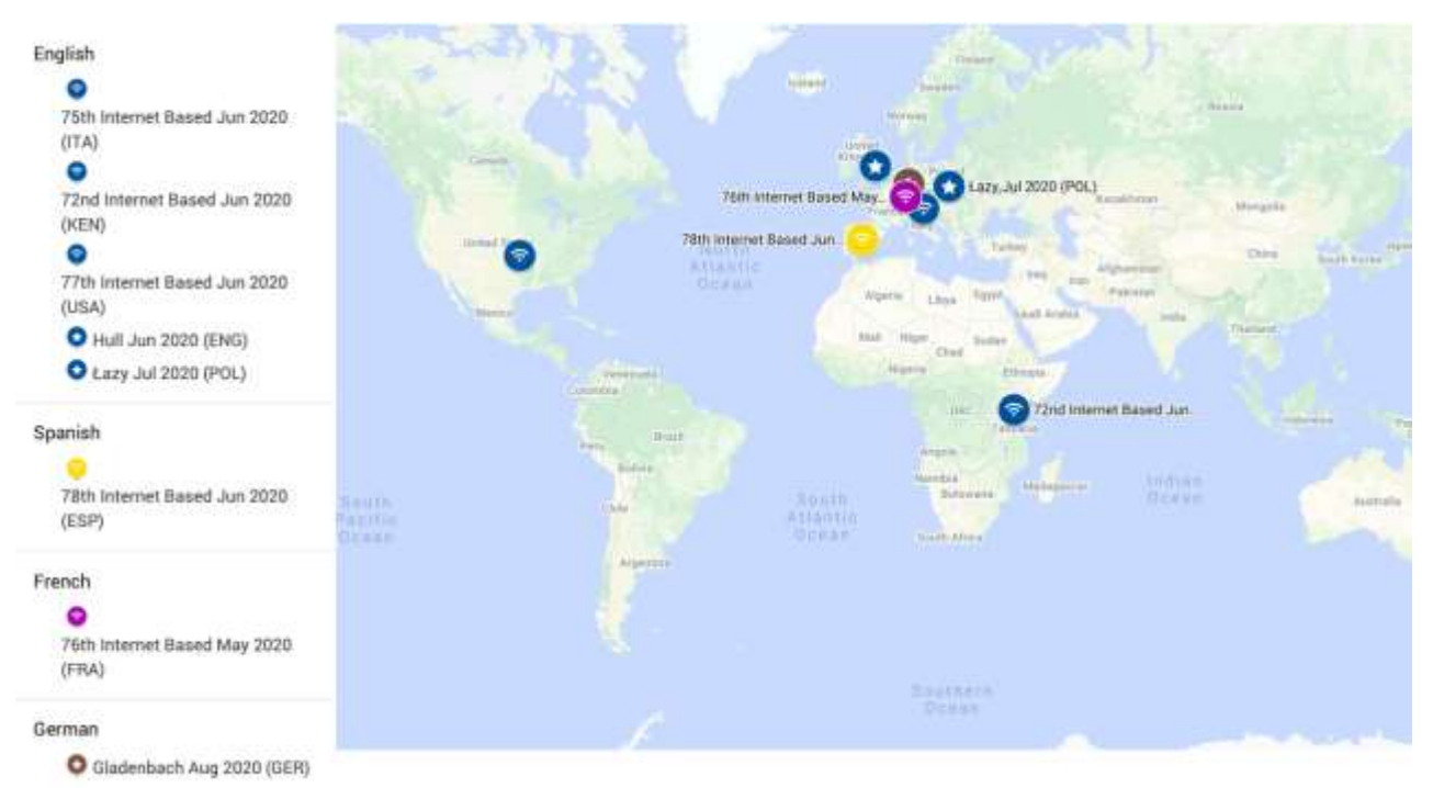
Map 2 – Seminars announced by May 26th 2020

One seminar planned in Ostfildern, Germany, 11-14 June 2020 was canceled.